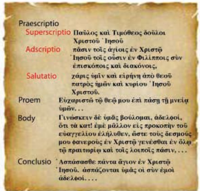
Ancient Letter on papyrus

Letter Writing Process. The actual writing of ancient letters, outside of very brief personal letters, was done by a writing secretary employed by the sender of the letter for this laborious task. These individuals were known as scribes, in Greek γραμματεὺς and in Latin amanuensis . They had training in writing, taking dictation etc. and were more polished in writing out documents. Paul alludes to this practice in 2 Thess. 3:17 by indicating that he had only written the Conclusio part of the letter according to his usual custom with his