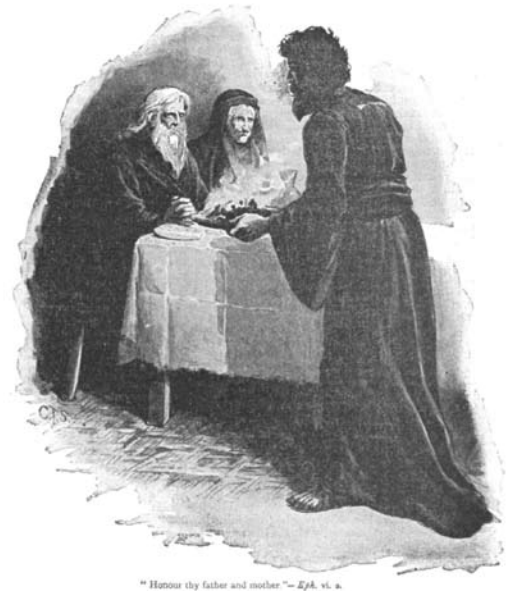
"Honor thy father and mother" -- Ex. vi. a.

First, children must be taught to 'listen to' their parents. At its core meaning , the biblical word used by Paul in verse one, ὑπακούω, insists that children pay close attention to the instructions of their parents. This must be enforced through disciplining of the children when they refuse. Children need boundaries as